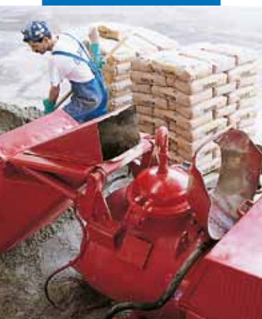
Mixing Topcem with an automatic pumping unit