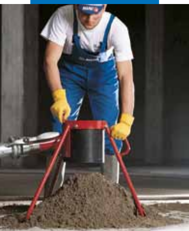
Batching a Topcem mix