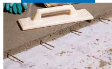
Detail of a Topcem screed with reinforcement rods