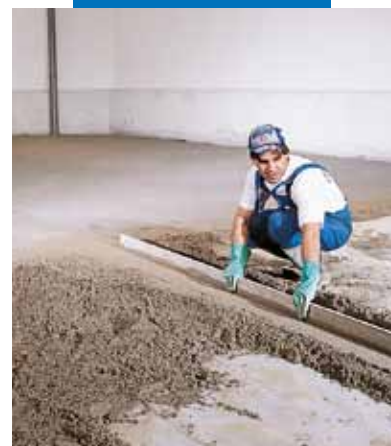
Preparing a levelling strip

All relevant references for the product are available upon request and from www.mapei.com