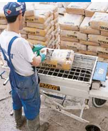
Mixing Topcem in a mini-batcher