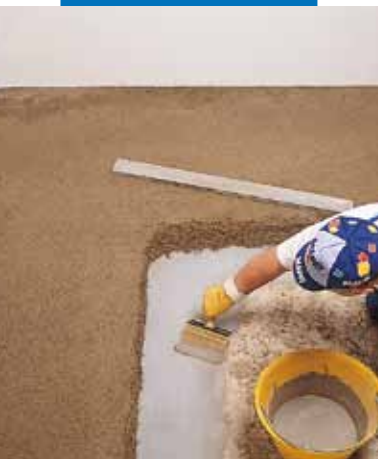
Spreading the anchoring slurry for bonded Topcem screeds