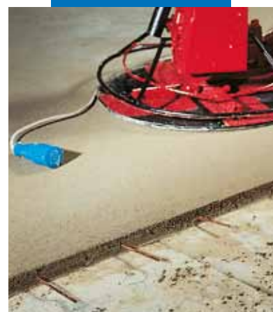
Power floating the surface of a Topcem screed